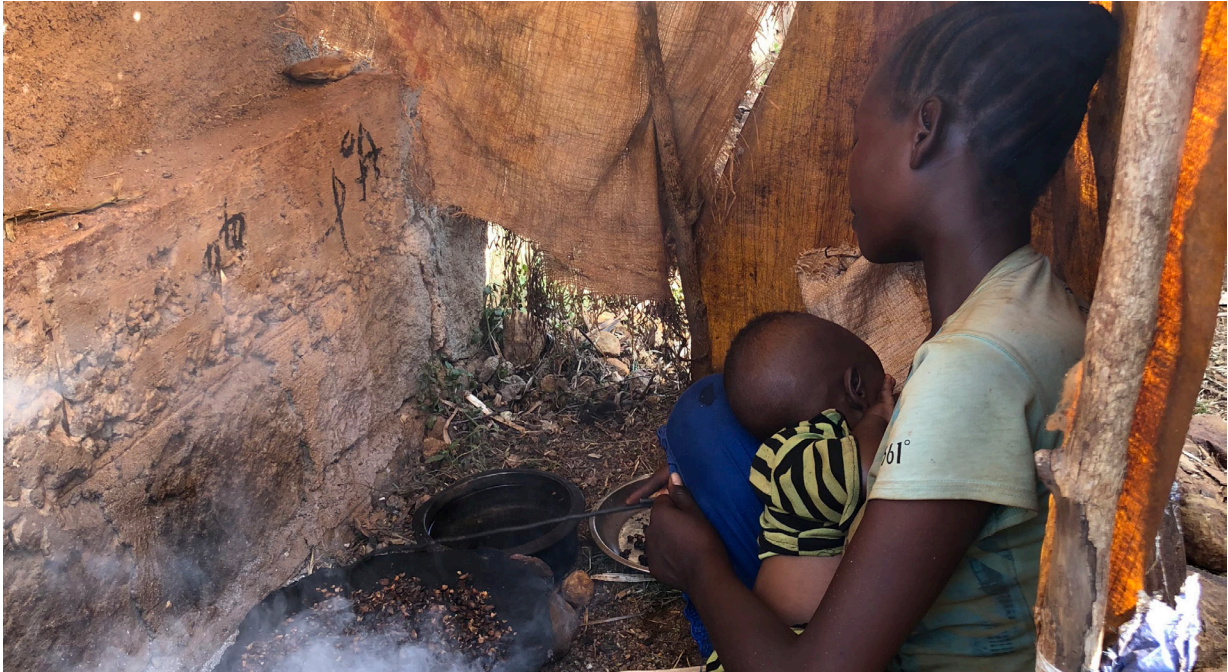
An IDP family living in a makeshift shelter in an informal, secondary displacement site on church grounds where almost 6,000 IDPs were living in squalid, unsanitary, and unsafe conditions. West Guji Zone, Oromia Region, Ethiopia.

U.S. Forest Service. In creating a new unit of the NDRMC, the government should seek to partner with agencies specialized in conflict-induced crises, such as the U.S. Office of Foreign Disaster Assistance (OFDA) or the European Union's European Civil Protection and Humanitarian Aid Operations (ECHO).