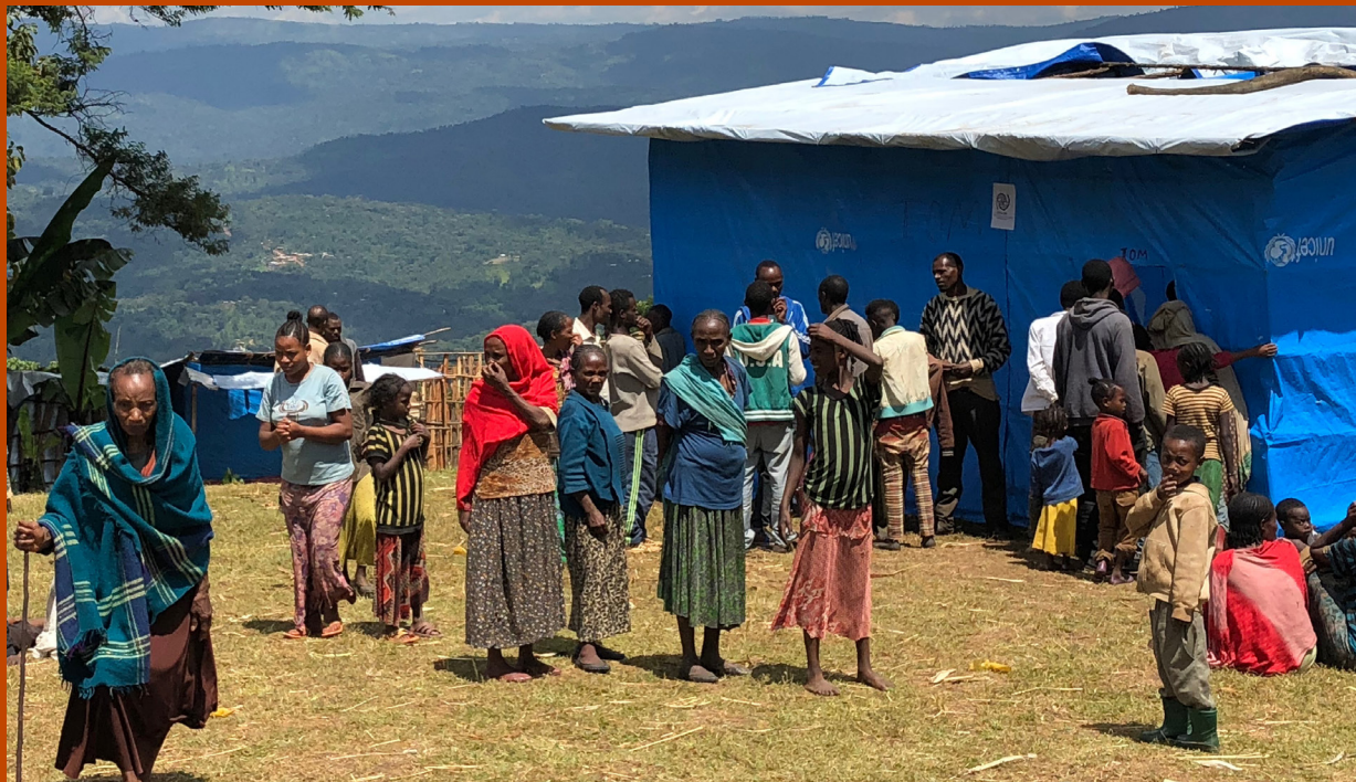
Secondary displacement site near Yirgacheffe, Gedeo Zone, the Southern Nations, Nationalities, and Peoples’ (SNNP) Region, Ethiopia.